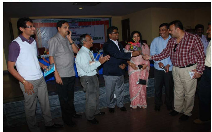
Rotarians at Mahajanas for Inauguration of Sky Way Block