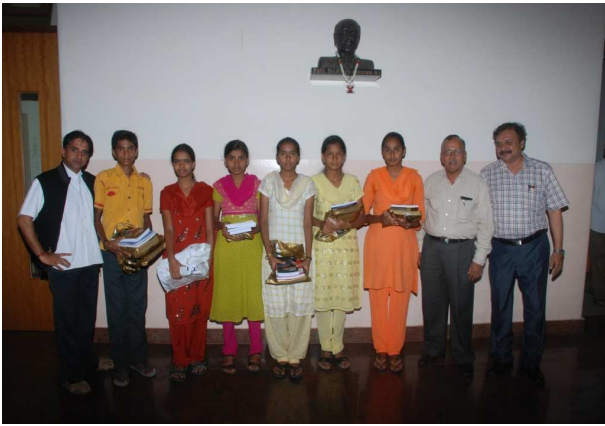
Diploma Students with Their text Books at Rotary Centre on 28/07/2011