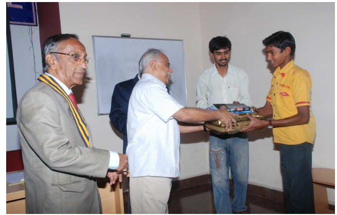
PDG. R. Guru Distributing Text books