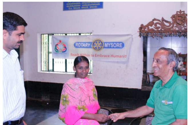
Interact Club of Sri.Viveka Tribal School H.D.Kote on 31/07/2011