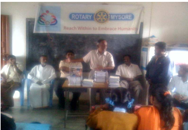
Books Distribution and computer Table's Distribution at Maddur Village On 03/08/2011