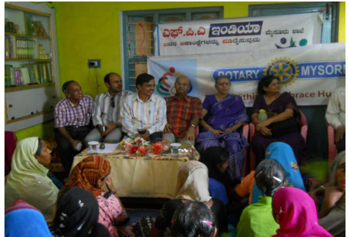
Breast Feeding week at Gousia Nagar on 04/08/2011