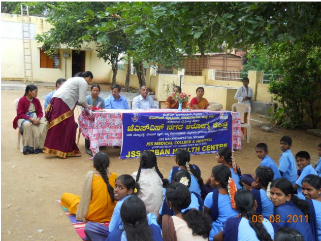
Health Club Inauguration under Swarna Arogya Chaithya