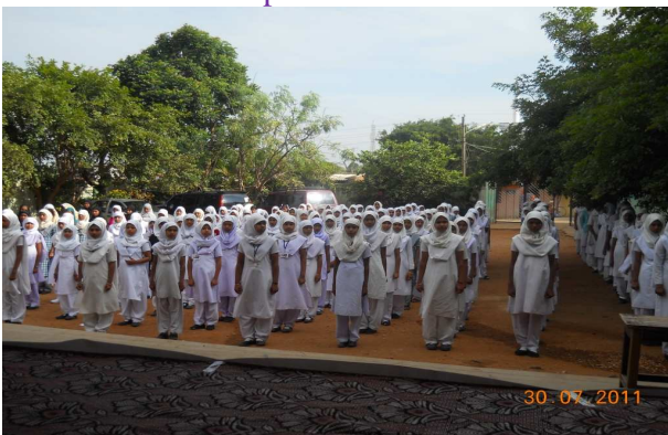
Students of Farookia School in Assembly

New Office Bearers for Maddur RCC were installed on 3 rd August 2011 and also books were distributed to the students. Two computer tables were donated.