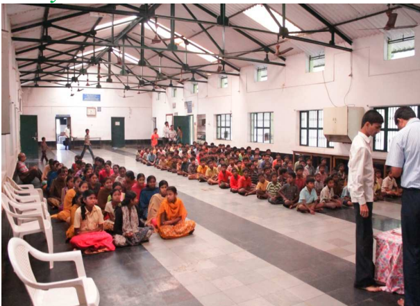
Students of Viveka Tribal School