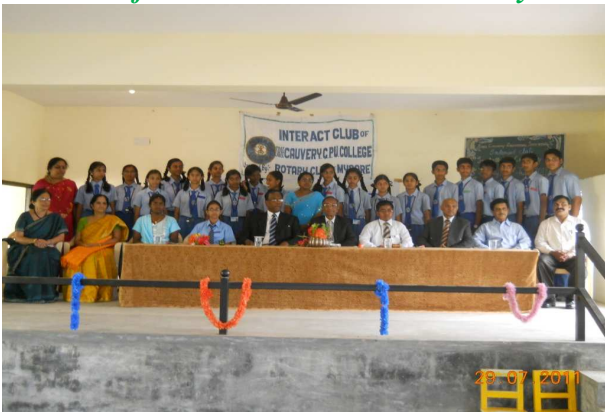
Interact Club of Sree Cauvery Composite on 29/07/2011