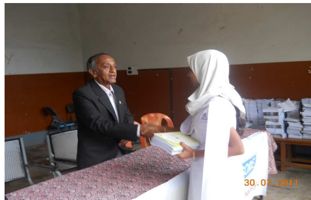
Book Distribution at Farooquia School on 30/07/2011