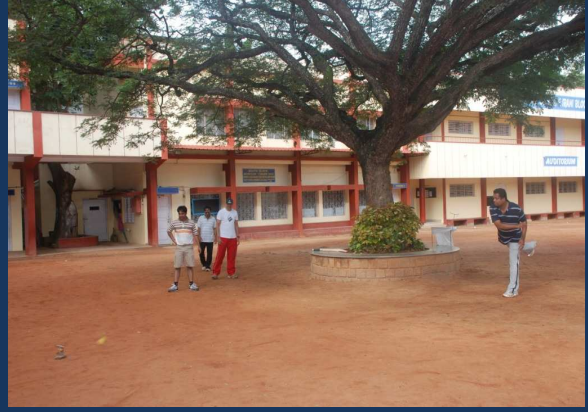
Our Every Sunday Fellowship with Cricket Team