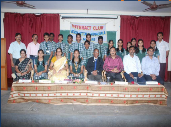
Interact Club of Vijaya Vittala Vidya Shala on 13/07/2011