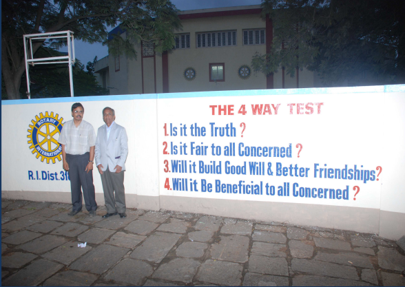
Four Way Test painted at our Rotary Centre