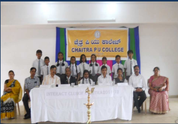
New Interact Team of Chaitra High School 18/07/2011