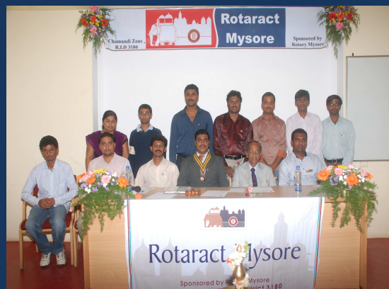
Rotaract Club of Mysore on 16/07/2011